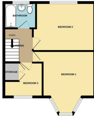
1ST FLOOR 403 sq.ft. (37.5 sq.m.) approx.